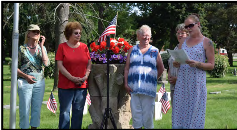
Above left: Members of Logan Auxiliary No. 20 on Memorial Day in Rockford, Illinois.